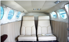
Interior fitting and matching colour scheme