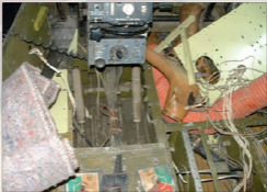
Stripping procedure begins